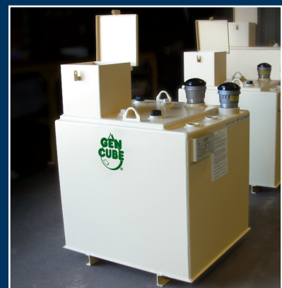
Gen Cube tanks are available in standard sizes from 60 to 20,000 gallons.