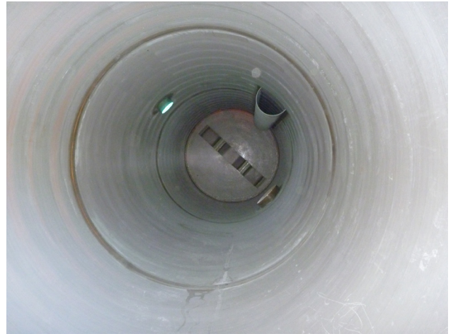
Maintenance free, smooth, high gloss, inner surface.

CSI Fiberglass Wetwells have been in service for more than 45 years. CSI wetwells are designed to meet or exceed the requirements of ASTM D 3753. They can be installed in a variety of soil conditions. Each wetwell is designed to withstand hydrostatic head pressure to grade with the wetwell completely empty.