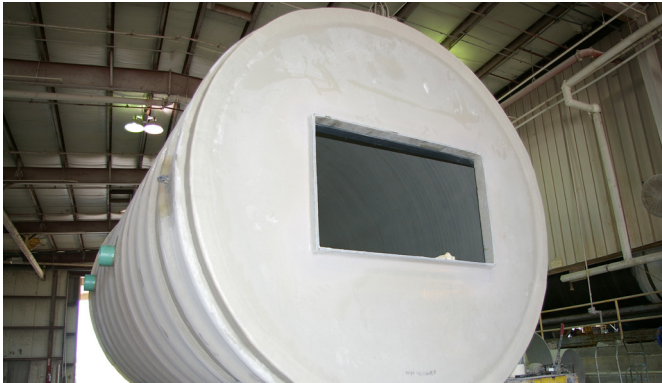
Flat top with rectangular opening. Appropriate dimension specified by customer.