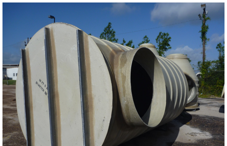
▼ STUBOUT INSTALLED AT WETWELL BOTTOM