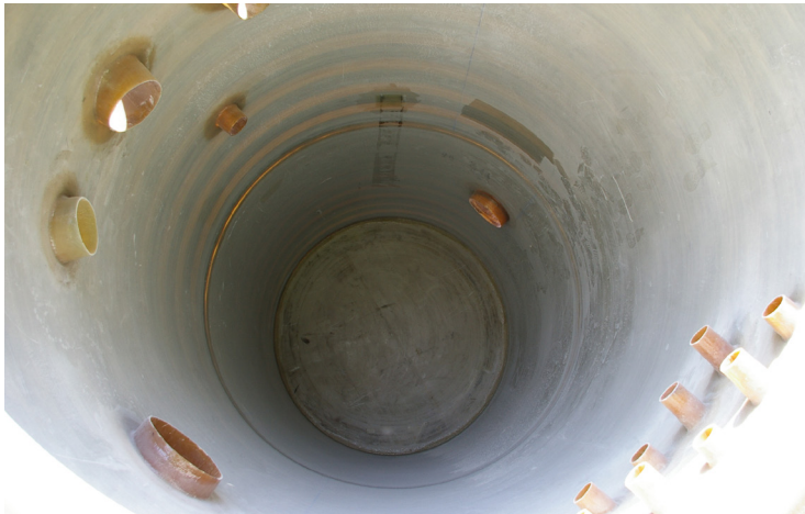
NON-CORROSIVE WITH A SMOOTH, HIGH GLOSS SURFACE ▲

All wetwell bottoms have structural anchors that embed in the concrete slab base to ensure a consistent safety factor over the life of the unit.