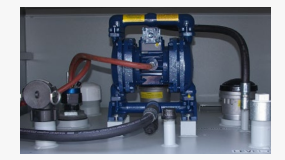
The SafeWaste mechanical components are enclosed in an easily accessible compartment.