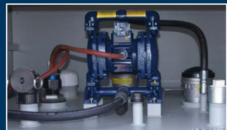
The Kombotank mechanical components are enclosed in an easily accessible compartment.