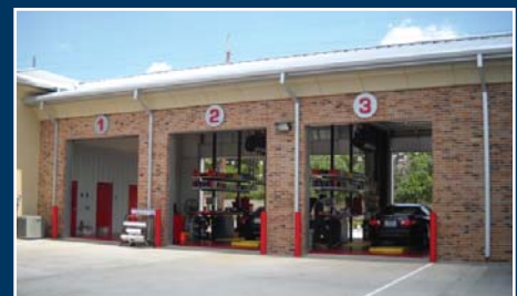
The Kombotank mechanical components are enclosed in an easily accessible compartment.